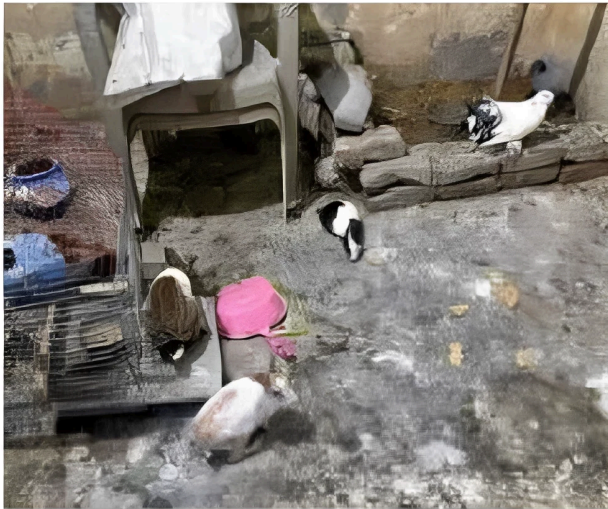
The DU report is based on a survey of 34 pet shops done across Delhi.