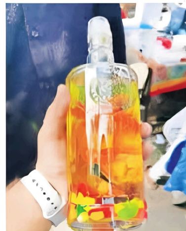
Animals kept in horrific conditions; (above) goldfish in a small bottle.

spection of pet shops at least once a year, continuous monitoring to prevent illegal sale of wildlife, and maintenance of records at shops.